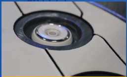
CAL GRIP COLOR OPTIONS